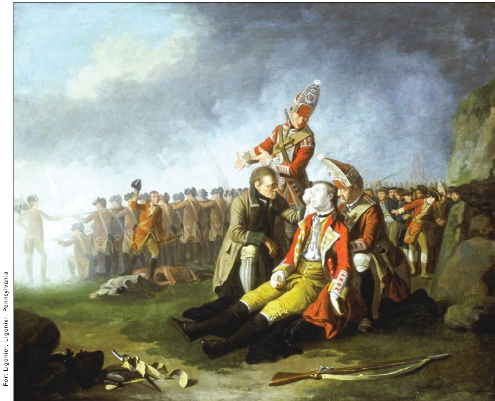
Fort Ligonier, Ligonier, Pennsylvania