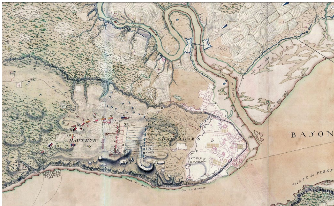
Detail of Québec promontory showing the positions [dotted lines] of the battle lines in relation to the topography and fortifications. Drawn from survey and signed by Patrick Mackellar, Wolfe's chief engineer, it is used as the contemporary source reference in the Biondo map.

In 1903, Doughty 'took another kick at the can,' publishing Québec Under Two Flags with fellow librarian N.E. Dionne, and writing: "Wolfe's line of battle extended almost from the cliff near the river St. Lawrence to the St. Foy Road, in a line with de Salaberry Street; and Montcalm's army met in a parallel line separated by only a distance of 40 yards." 11 This conclusion is essentially what Doughty and Parmelee wrote in 1901. Finally, in 1908, Doughty produced a large fold-out map which was included in a souvenir program for the Québec Tercentenary celebrations. This map confirmed his earlier calculations. 12