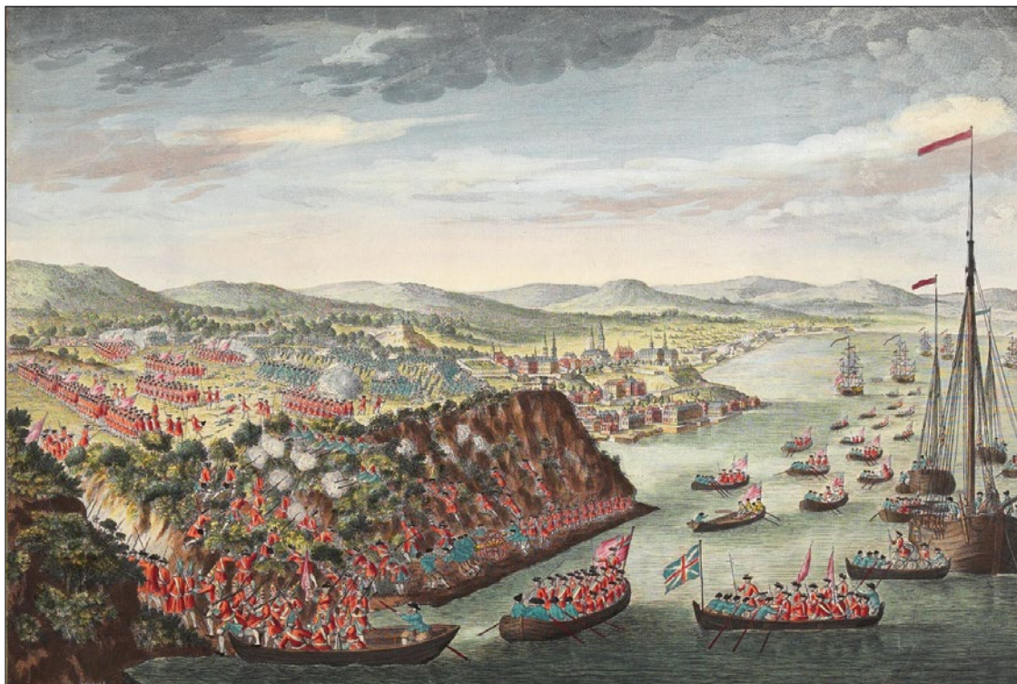
A view of the taking of Québec, 13 September 1759.

Library and Archives Canada, Acc. No. R9266-2102 Peter Winkworth Collection of Canadiana