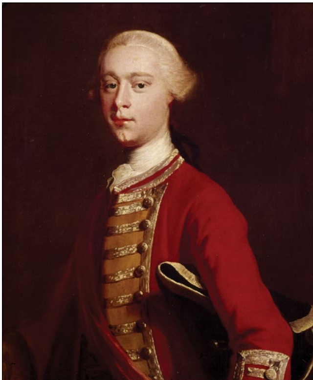
Major-General James Wolfe, pyrrhic victor of the Battle of the Plains of Abraham.

Extensive modernization projects west of the city fortifications has made the 1759 battlefield topography disappear. The only remaining topographic feature with any approximation to 1759 is the elevation formerly known as Wolfe’s Hill – although altered as well for the construction of the former prison, and later, the museum itself. Wolfe’s Monument, situated in front of the main entrance of the Musée, is generally considered to be the place where James Wolfe died on 13 September 1759. It is well documented that Wolfe was carried a short distance to the west after he was shot and before he expired. Thus, a point close to these structures must suffice for the purposes of this project.